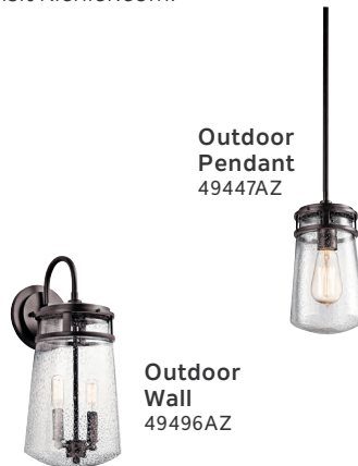
Outdoor Pendant 49447AZ

To see the complete Lyndon™ Collection visit Kichler.com.