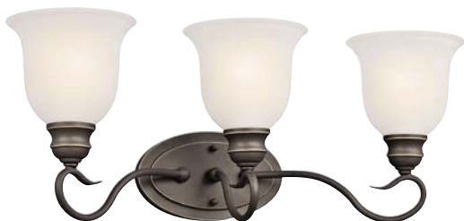
B | 45903 NI, OZ 45903 NIL16, OZL16