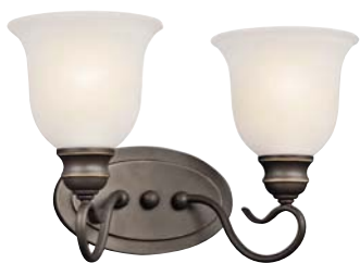
A | 45902 NI, OZ 45902 NIL16, OZL16

Finish: Olde Bronze® or Brushed Nickel Glass: Satin Etched