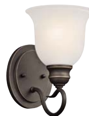
D | 45901 NI, OZ 45901 NIL16, OZL16 Wall Sconce