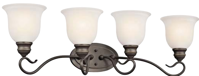
C | 45904 NI, OZ 45904 NIL16, OZL16