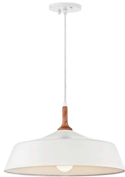
B | 43683 WH Pendant